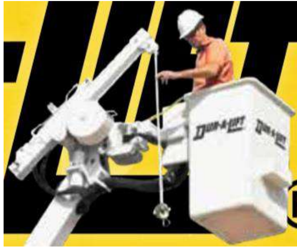
DPM-52 Side Mount Winch & Jib