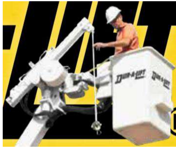
DPM-52 Side Mount Winch & Jib