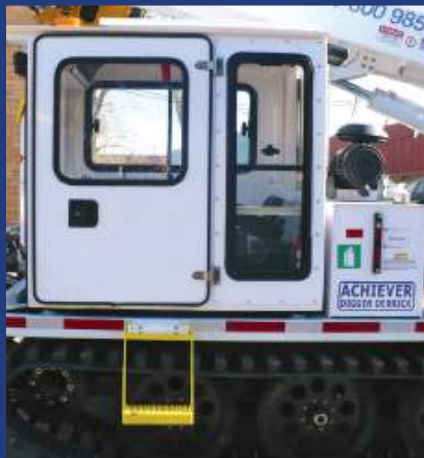
The optional closed cab comes with a front wiper, heater and two opening windows