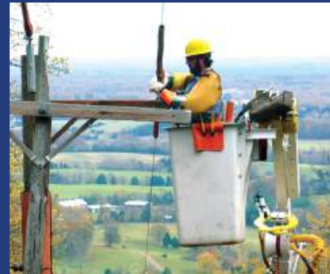
The insulated bucket has a 47' reach and comes with full pressure controls and an optional tool outlet and jib