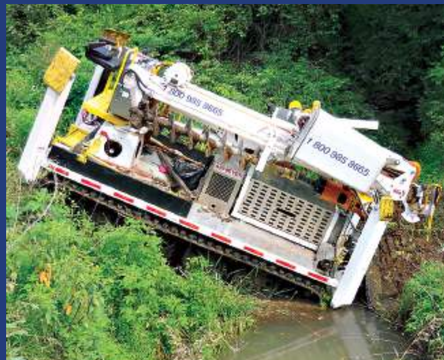
The Achiever's advanced track and suspension design and powerful engine allow it to go almost anywhere