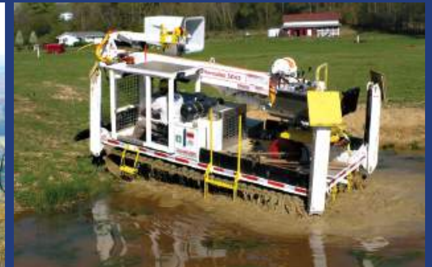
Low ground pressure means excellent flotation on soft ground