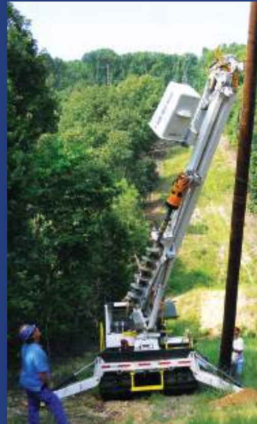
The Achiever can set up to 70' poles