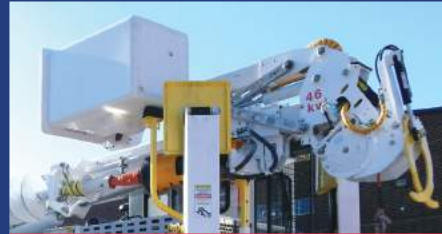
6,000 lb boom tip winch On fiberglass 3 rd boom, Insulated