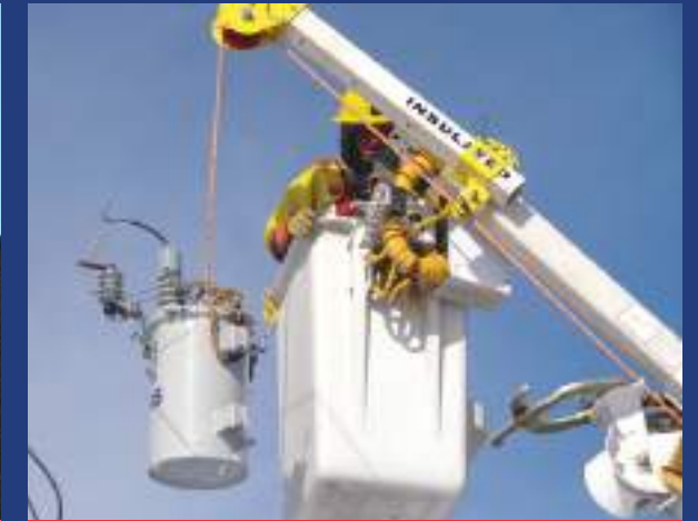
The optional material handling jib can lift up to 600 lbs